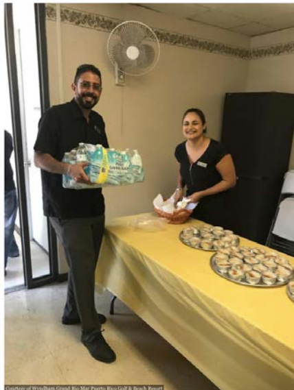
The Wyndham's staff pitched in to help the community after hurricane Maria.

The Wyndham Grand Rio Mar Puerto Rico Golf & Beach Resort is re-opening on March 1 after a multi-million dollar renovation. But there's way more to this story than another luxury resort rebuilding project. During the aftermath of the hurricane that crippled the island, the resort upgraded restaurants, bars and other areas and their community-minded team of volunteers helped a local housing for the elderly out too.