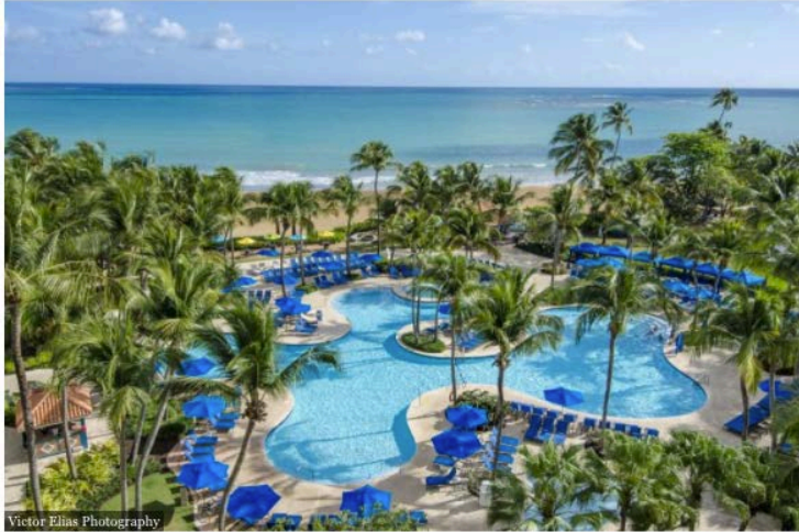
Wyndham Grand Rio Mar, Puerto Rico