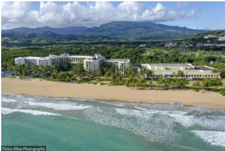
Wyndham Grand Rio Mar Puerto Rico Golf & Beach Resort

Opinions expressed by Forbes Contributors are their own.