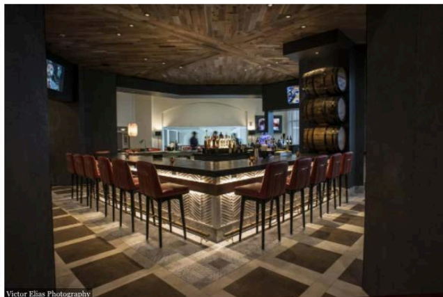
The resort's brand new rum bar