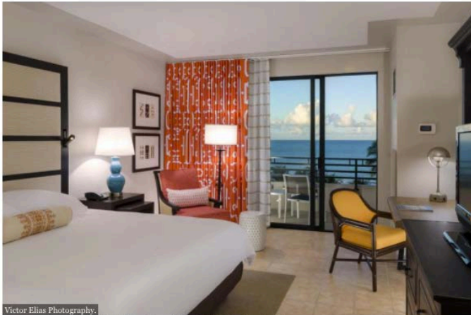
An ocean front room at the Wyndham Grand Rio Mar, Puerto Rico