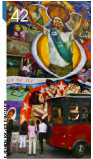
PHILADELPHIA MURAL ARTS TOUR