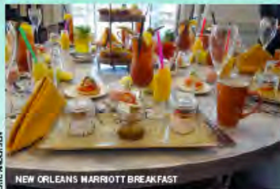
NEW ORLEANS MARRIOTT BREAKFAST