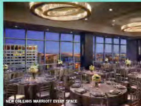
NEW ORLEANS MARRIOTT EVENT SPACE