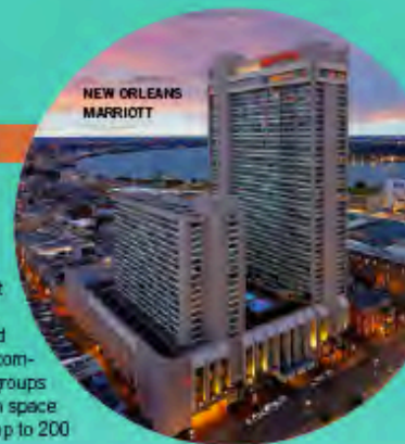
NEW ORLEANS MARRIOTT

And lastly, if your group is more interested in blending in with the locals, our media group discovered that