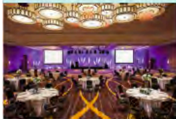
SHERATON NEW ORLEANS HOTEL GRAND BALLROOM