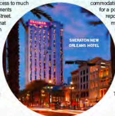
SHERATON NEW ORLEANS HOTEL

a bus tour of the Garden District can provide a nice escape from all the tourists on Bourbon Street.