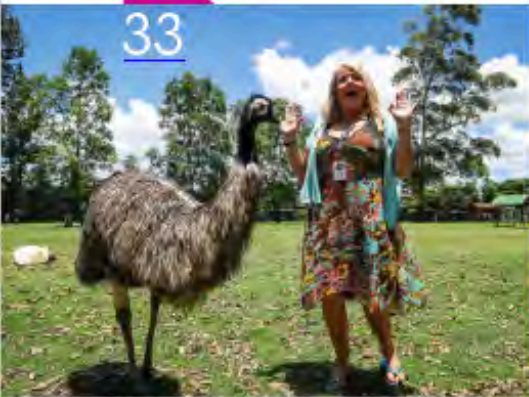
LONE PINE KOALA SANCTUARY, BRISBANE, AUSTRALIA