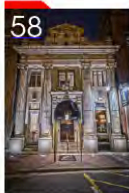
BYRD & BALDWIN BROS. RESTAURANT, NORFOLK, VA.