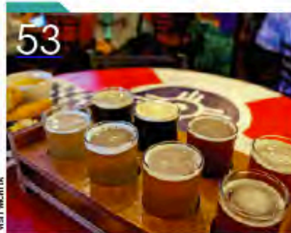
RIVER CITY BREWING CO., WICHITA, KANSAS