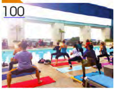
MANCHESTER GRAND HYATT, SAN DIEGO