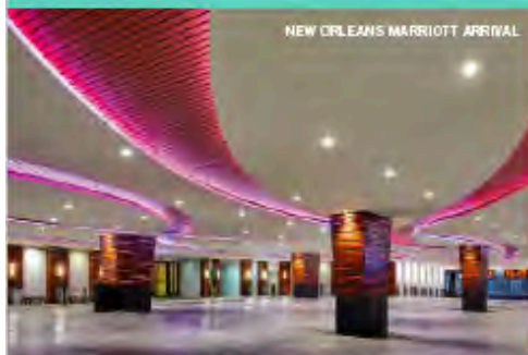
NEW ORLEANS MARRIOTT ARRIVAL