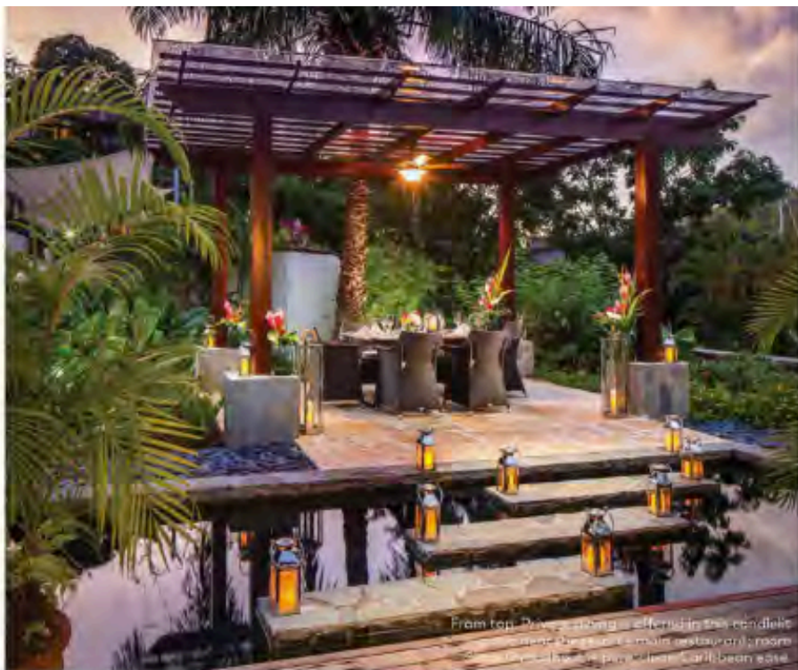
From top: Dining tables are lit from the candles around the pool; main restaurant; room; view from a private Caribbean gazebo.

class mixologists and rum savants but also greet customers with local charm, insider info and a warm “ sa ka fete ” (the local French-Creole greeting).