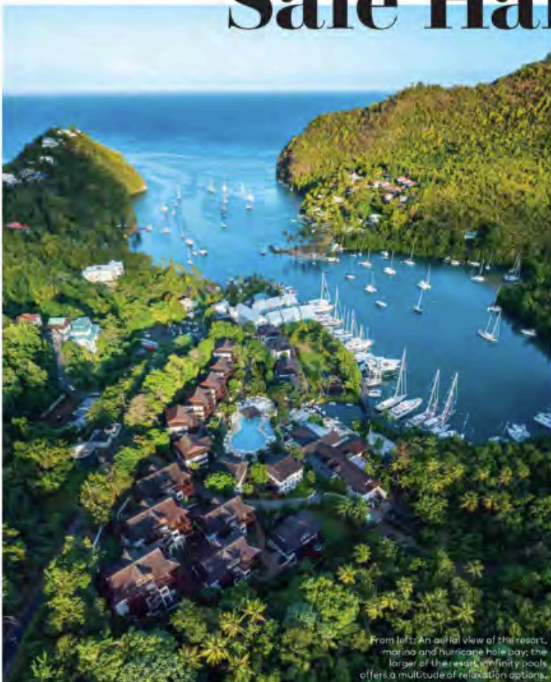
From left: An aerial view of the resort, marina and hurricane hole bay; the larger of the resort's infinity pools offers a multitude of relaxation options.

With its picture-perfect "hurricane hole" bay, St. Lucia's Marigot Bay Resort & Marina by Capella has been an in-the-know choice for some land-side relaxation for Caribbean sailors for decades. But the hotel and marina's unparalleled water access offers elite landlubbers the opportunity to experience a touch of the luxury yachting lifestyle as well.