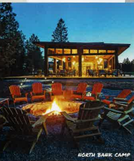
NORTH BANK CAMP

For family excursions without the sleepless nights, check into The Resort at Paws Up . Earlier this year, the Greenough, Montana, retreat debuted its secluded North Bank Camp, a small collection of two- and three-bedroom tents for adventurous groups. On a bluff over the Blackfoot River, North Bank has all the swanky amenities—underfloor heating, furnished decks, camp chefs, private butlers—that Paws Up is known for, plus a brand-new dining pavilion and firepit, where s'mores are browned to perfection. Bonus: Some of their cabins are now getting in on the glamping game too, with 500-square-foot tents to lure kids and kids-at-heart to camp out on the grass. From $2,783/night, including meals, for a two-bedroom for four people; pawsup.com .