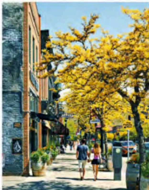
From left: surfers on the rushing Clark Fork River; strolling North Higgins Ave. in downtown Missoula