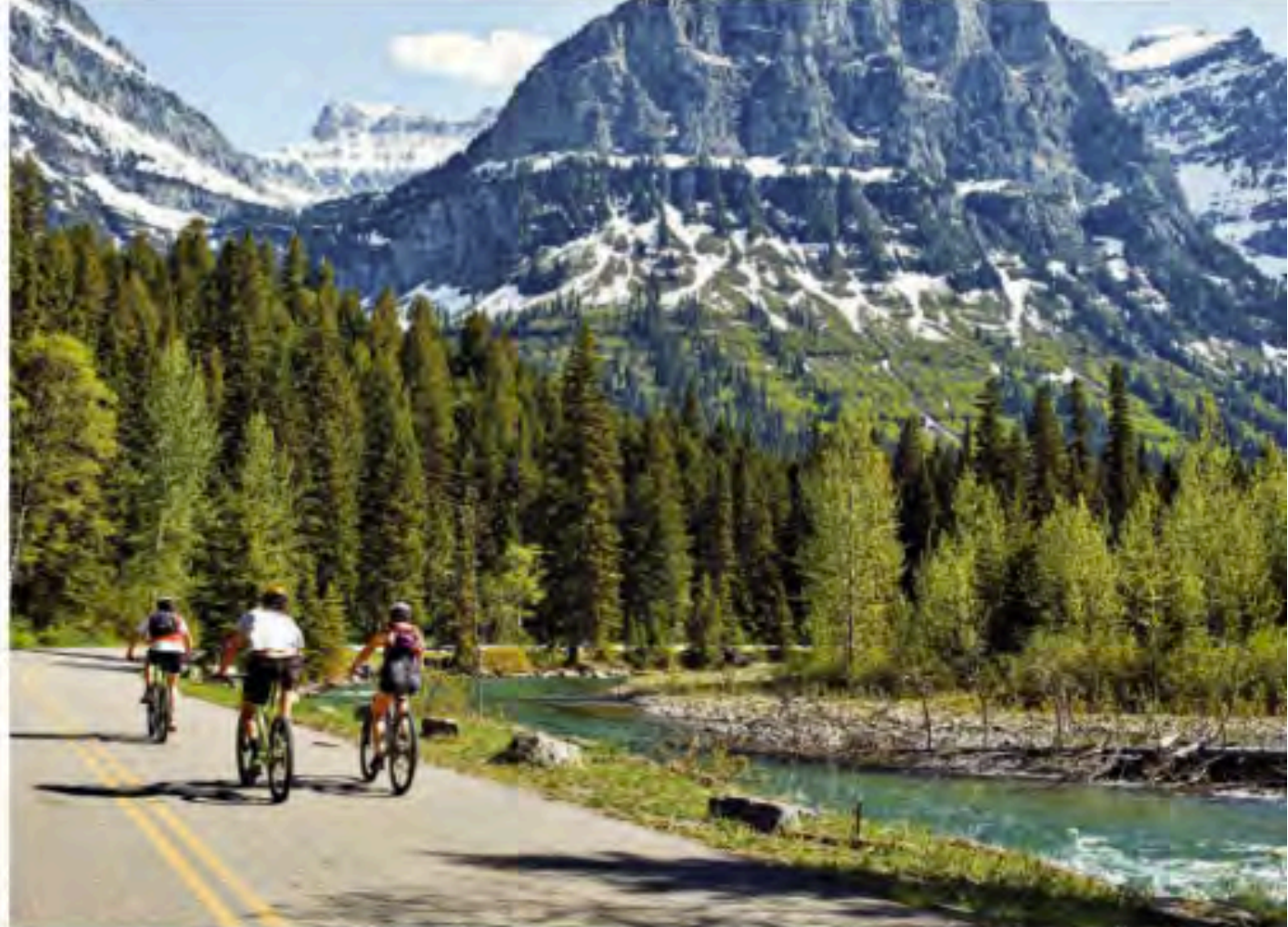
From top: cycling the Going-to-the-Sun Road along McDonald Creek in Glacier National Park; cardo con mole at Scotty's Table in Missoula

to be their idea, otherwise it won't stick." I recognize the principle from parenting.