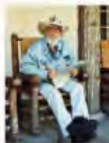
Clockwise from left: fireworks at Paws Up; a huckleberry mojito at Paws Up; hanging on the porch at Lake McDonald Lodge; an old school sign for a café on Highway 93