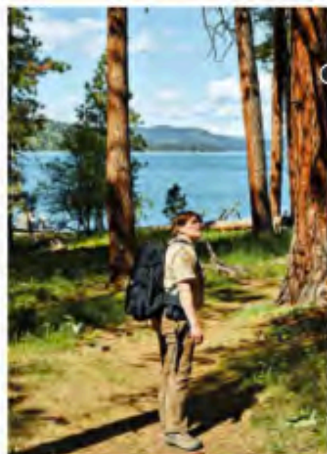
Above: there is no clear divide between fly fishing and religion in Montana

"I always say, you work with a horse the way you work with a man," she says. "You know the outcome you want to achieve, but it has