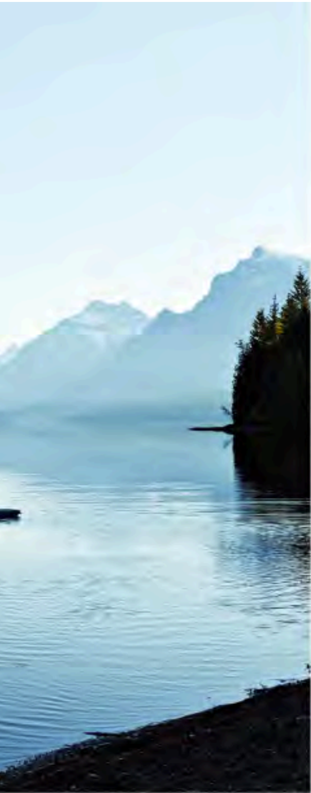
Above: kayaking on Lake McDonald in Glacier National Park; opposite page: a café on Highway 93