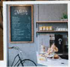
The Society Hotel Portland, Oregon

Opened in 2014, Santa Barbara's Wayfarer is more than a hostel; it's an intimate, playful property with lots of communal space that blends the convivial vibe of a backpacker lodge with the comfort of a luxury resort. Public spaces include a library, a game room with an oversize Jenga set, a lobby dining area that offers wine on tap, and an outdoor pool with enough inflatable furniture for a frat party. In the shared and private rooms, expect cool design touches (after all, the city's hip Funk Zone is just outside) such as mermaid wallpaper, pig-tailed-lion pillows, and faux-fur throws, plus clever, shoulder-high Murphy bunk beds that pull out above headboards to maximize the limited floor space.